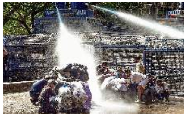
Water cannons being used to disperse agitators during a protest march by members of the Kerala Students Union (KSU) to the state Legislative Assembly against alleged police atrocities in the state, in Thiruvananthapuram.

"The BJP will take every step to strengthen democracy and expose infiltrators whom Congress wants to empower," Thakur declared.